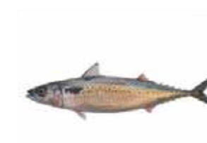
Chub Mackerel Scomber Japonicus

Catching Season: January, February, March, April, May, November, December.