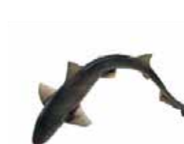
Patagonian Smoothhound, Narnownose Smoothhound Shark Mustelus Schmitti

Options: Fillets, HGT, HGT Peeled, Fins.