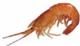
Argentine Red Shrimp Pleoticus Muelleri

Options: Whole(HOSO), Headless(HLSO), Peeled and Devained (PCD), Peleed (PDU).