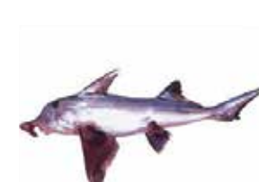
Elephant Fish Callorhynchus Callorhynchus