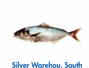
Silver Warehou, South Atlantic Bream Serirolella Porosa, Seriolella Punctata

Catching Season: January, February, March, April, May, June, July, August, December.