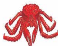
Southern King Crab Lithodes Antarticus Lithodes Santolla

Options: Clusters, White Meat, Red meat.