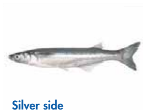
Silver side Atherinidae spp