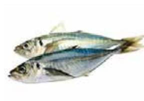
Horse Mackerel Trachurus Trachurus, Trachurus Murphyi

Catching Season: October, November, December.