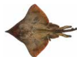
Skate Dipturus chilensis Raja flavirostris