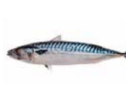
Mackerel Scomber Scombrus, Scomber Japonicus

Options: Whole Round. Origin: Europe, Iceland, Japan, Korea, China, Ecuador, Peru.