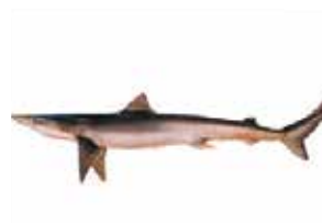
Tope Shark Galeorhinus Galeus, Galeorhinus vitaminicus

Catching Season: April, May, June, November, December.