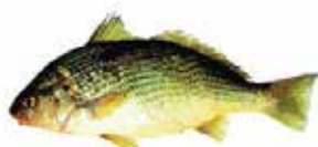
Argentine Croaker Umbrina Canosai

Catching Season: Catching Season: December, January, december February, March, April, May, June.