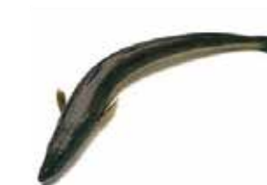
Brazilian Flathead Percophis Brasiliensis

Catching Season: January, February, March, August, September, October, November, December.