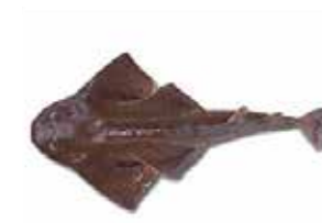
Angel Shark, Angular Angel Shark Squatina Guggenheim, Squatina Argentina