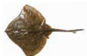
Skate Raja SPP