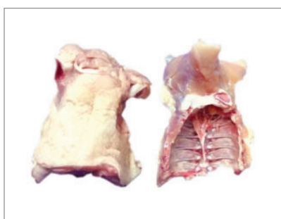
Chicken Upper Back