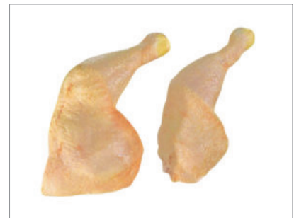
Chicken Leg Quarter