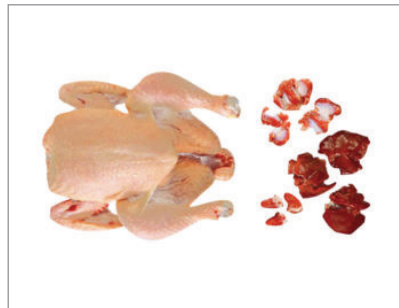
Whole Chicken with or without giblets